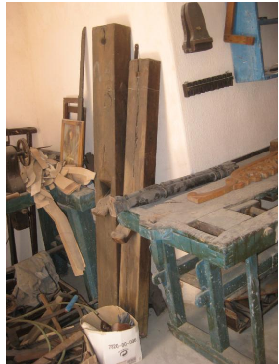
The old hand planes in the museum in Thira, on the island of Santorini