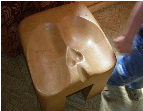
Bar stool for a kilt wearing Scotsman

A larger picture with more intimate details can be obtained from the Shed.