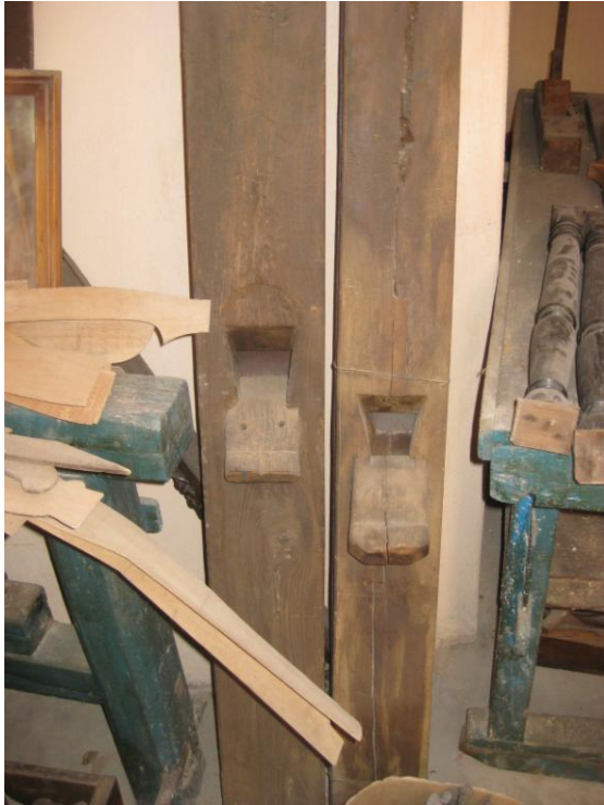
Closer picture of the old, long hand planes