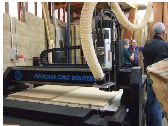
KMS members visiting the Dwellingup Heritage Centre