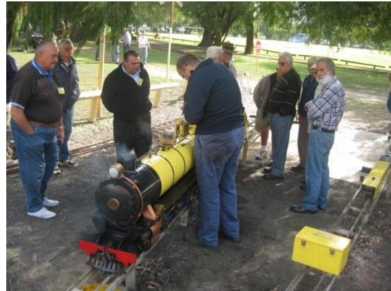
KMS members admiring a model loco.

There was a parade of old cars & trucks, a number of motor bikes which may have had an activity earlier in the day.