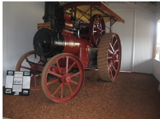
An immaculately restored tractor at Dardenup