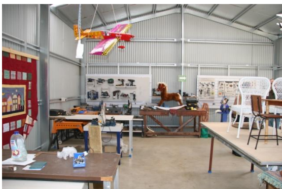
A view of the interior of the shed.