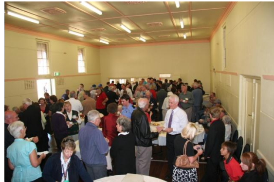
The morning tea being enjoyed by many.