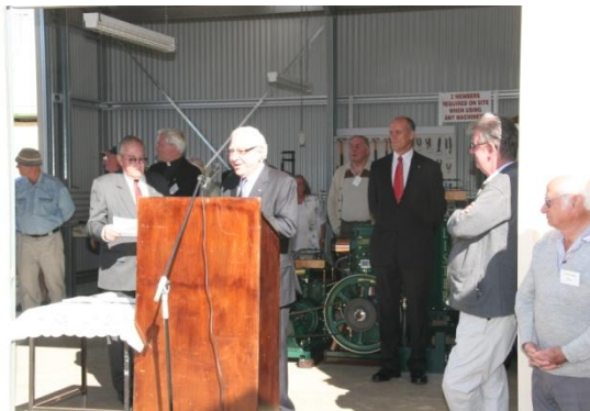
The Governor addressing the gathering prior to opening the Beverley Shed.

It was most pleasing to see that the Governor lingered at the shed to look closely at the tools and machinery, (he has a PhD in engineering) and to speak at length to visitors, members and local school children.