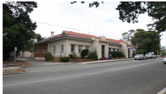
A view of the old shire office and police station showing the heritage features of the building.

So, is the closure of the Kalamunda Police Station a threat or opportunity to us? Let us treat this as an opportunity to develop a community facility which not only meets the needs of our members, but also enables us to contribute to other aspects of the Kalamunda community, in accordance with the KMS objectives. Your Committee will keep you posted on progress.