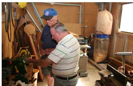
Turning up a wooden pencil kit at South Perth.